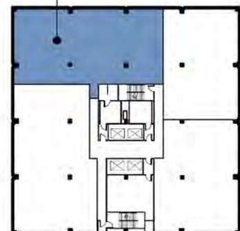
4TH FLOOR KEY PLAN