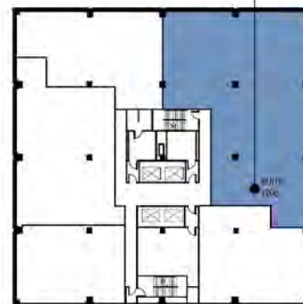
12TH FLOOR KEY PLAN