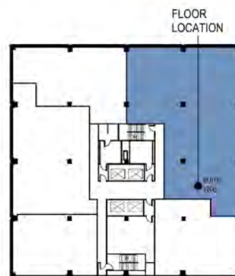
12TH FLOOR KEY PLAN