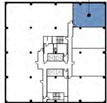
8TH FLOOR KEY PLAN