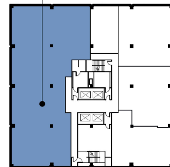
11TH FLOOR KEY PLAN