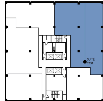
12TH FLOOR KEY PLAN